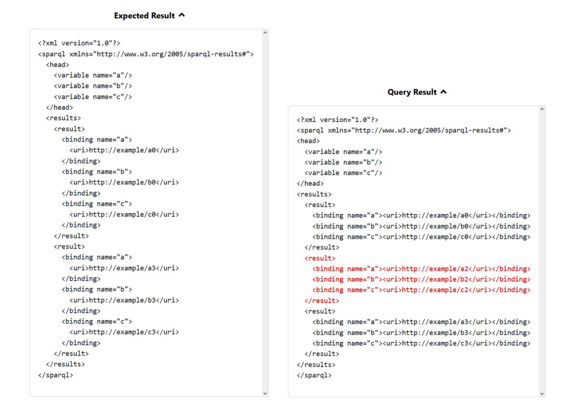
Figure 3.1: This is the result of the generated string with HTML elements highlighting the differences

prevent this, we had to add a check to the regular expression to stop a result from being highlighted twice. For example, an XML format containing three empty results would cause the first empty result to be highlighted three times, while the other two would not be highlighted at all.